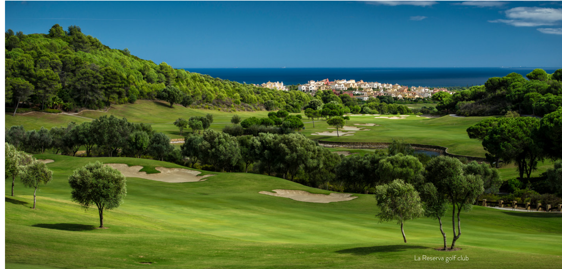
La Reserva golf club