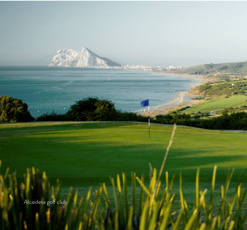
Alcaidesa golf club