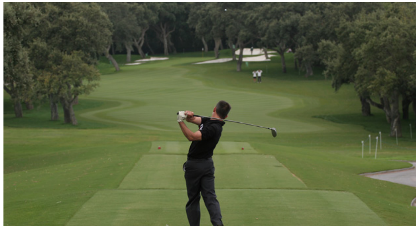
Real club de golf Valderrama