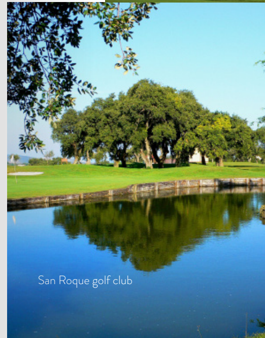
San Roque golf club

La Reserva Club in Sotogrande is just 5 minutes away and has many facilities on offer including the Golf Course, Horse Riding and the original 'The Beach', a fantastic resort beside the Golf Course which includes a restaurant, white sandy beach and lagoon for sports activities etc.